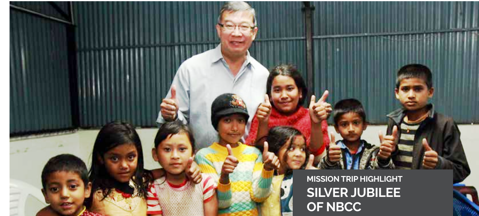
MISSION TRIP HIGHLIGHT SILVER JUBILEE OF NBCC

SEEING GOD'S HANDIWORK THROUGH HIS CHURCH